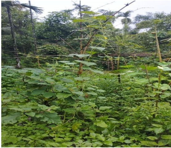
Cucumber at its flowering stage