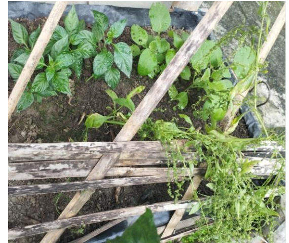
Chilli and brinjal Seedlings