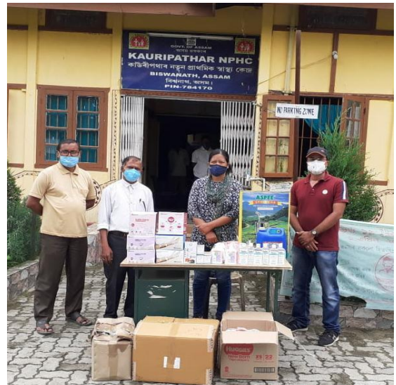
Medical Aids provided two Kawripathar & Gomeri New PHC