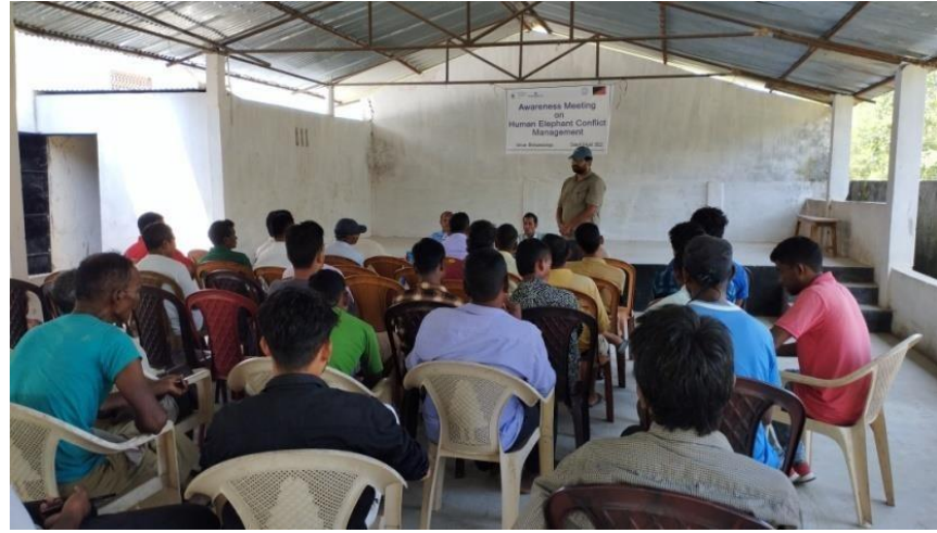
Photos captured during awareness programme organized by DCDP in collaboration with WWF on “human elephant conflict management”