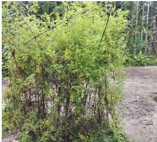
Local Tomato plant