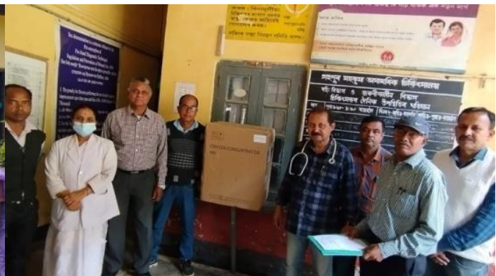
Oxygen Concentrator receiving by the Kawripathar New PHC & Gohpur Civil Hospital, Biswanath District.